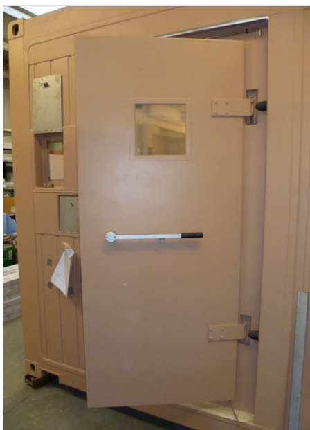
Manual operate Door Single leaf Welding frame