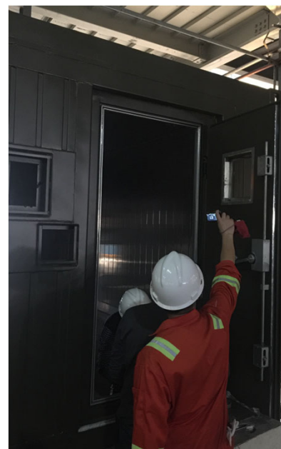
Manual operate Door Single leaf Welding frame Assemble work