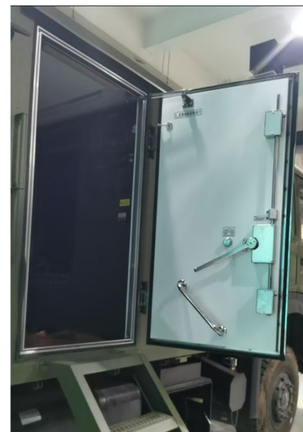
Manual operate Door Single leaf Riveting frame