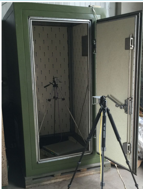
Manual operate Door Single leaf Welding frame Demo room under testing