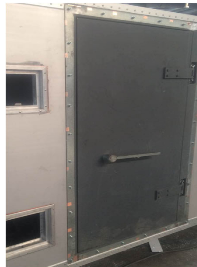
Manual operate Door Single leaf Riveting frame