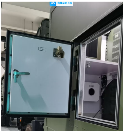
Manual operate Door Single leaf Welding frame Emergency Escape Door