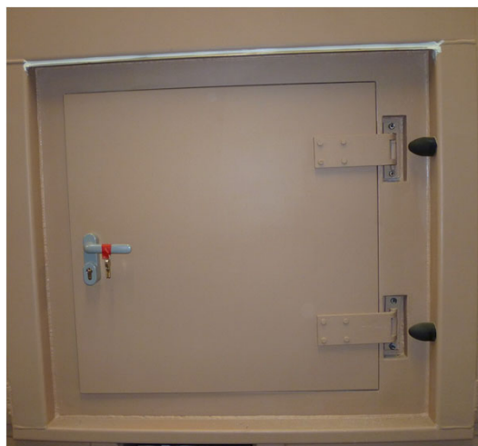
Manual operate Door Single leaf Welding frame Emergency Escape Door